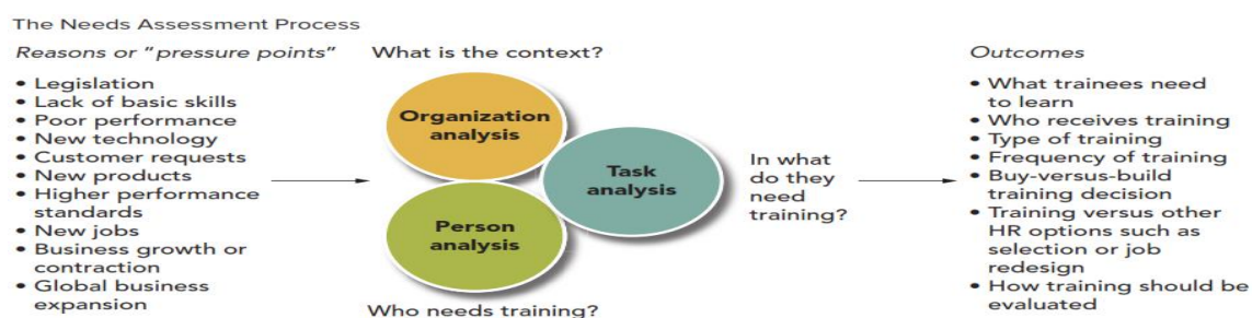
Figure 1: Needs Analysis Process

Development needs analysis is a simple way to identify existing gaps in knowledge, as well as strengths and weaknesses in the process that allow or hinder effective training programs delivered (Hartoyo, 2017). Development needs analysis is a formal process that identifies needs as gaps between current results and expected results, which places those needs in order of priority based on the costs of meeting each need rather than cost, by selecting the most important needs (Kaswan, 2016). In conducting development needs analysis, development needs to be performed at three levels of analysis, namely: Organizational Analysis, Job Analysis and Individual (employee) analysis. As shown in the figure below.