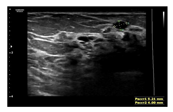
Fig. 3 Sonogram of the breast with BBD with the phenomena of fibrosing of glandular tissue and the presence of cystic inclusions.

The cystic form of BBD was characterized by a thickening of the glandular tissue and the presence of pathological cavities of more than 3 mm, consisting of a wall and a liquid or porridge content (Fig. 4).