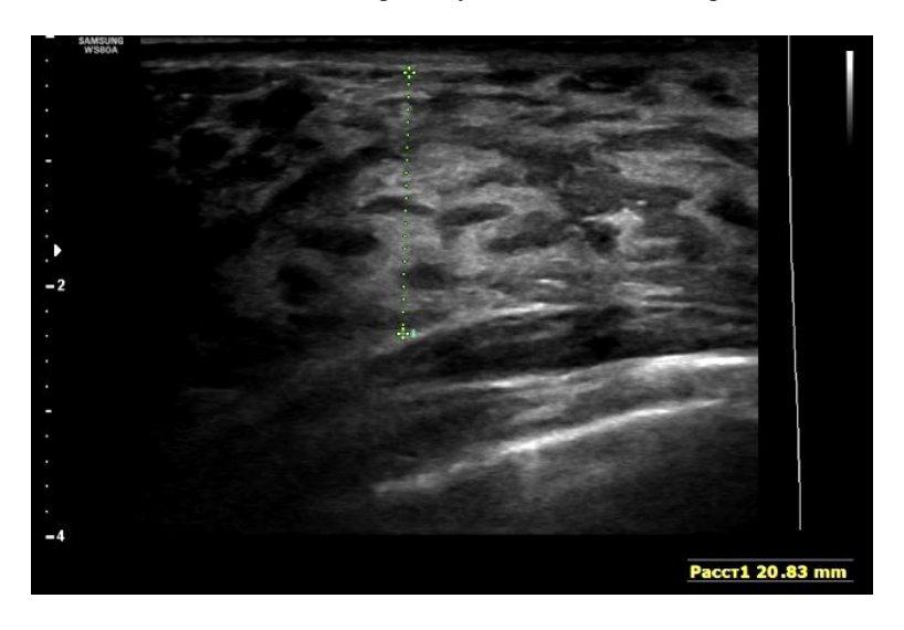
Fig. 2 A sonogram of the breast with the glandular form of BBD with a thickened glandular layer in the form of a continuous layer of glandular tissue of medium echogenicity.

During thesonographic examination of women with BBD without mastalgia the glandular form prevailed -81.43% (57/70), which was more common than in women with BBD with mastalgia (52.94% (36/68) 1.54 times (OS 3.90; 95% CI 1.81-8.40.) Sonographic study revealed a thickened glandular layer in the form of a continuous layer of glandular tissue of medium or reduced echogenicity in women with the glandular form of BBD. (Fig. 2).