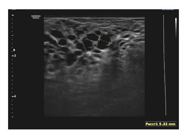
Fig. 5 Sonogramofthebreastwithductectasia.

Breast ductectasia, characterized by pathological expansion of the canals and ducts of the breast, was recorded only in 7.35% (5) of patients in group A, of which 5.88% (2) of women were subgroup A1 and 8.82% (3) of the subgroup A2 (p> 0.05) (Fig. 5).