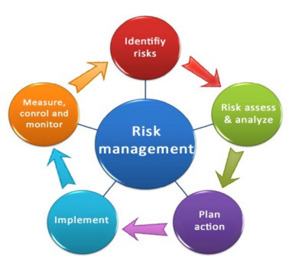
Fig.2: Risk Management

Risk is for all intents and functions one thing that debilitates or limits the potential of a gaggle or philanthropic association to accomplish its main goal. Risk management is that the procedure of distinguishing risk, It area unit usually shocking and erratic occasions, as an example, devastation of a building, the wiping of all our laptop records, loss of stores through larceny or harm to a neighborhood though guest agency stumbles on a tough floor and chooses to sue. They are doing they are going to presumptively harm our association, money loss, or measurement risk, and making moves to diminish risk to a worthy level and association in an passing most dire outcome conceivable, cause you to shut. association in an exceedingly most dire.