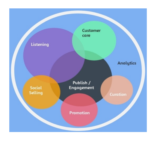
Fig.3: Social media promotion management

Turning most likely negative things into positive ones was one of the foremost necessary opportunities social media offered. Everyone uses social media in their everyday lives, whether or not or not it is Facebook, Instagram, or one factor as easy as email. What would businesses do whereas not social media? The utilization of social media has created a large impact on businesses. Social media has created a positive impact on businesses as a result of it is saved time and money.