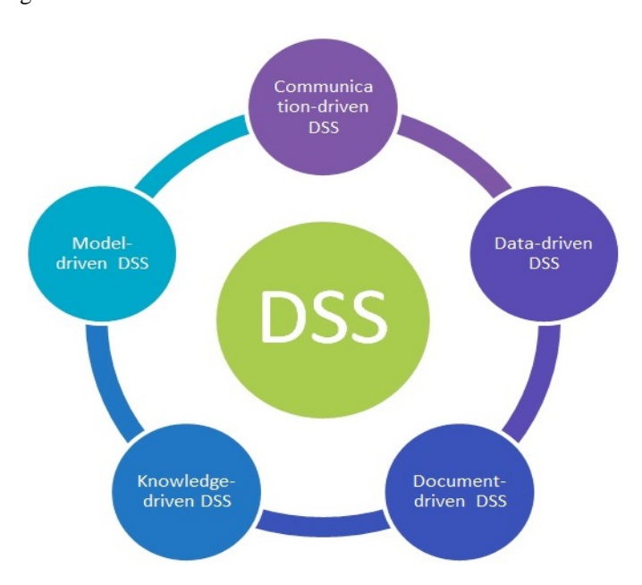
Fig.1: Decision Support System

Decision Support Systems many businesses unit of measurement sweet-faced with things that need appraisal, Frito Lay is associate example of an organization World Health Organization enforced varied decision support systems into their business model. Effective utilization of laptop computer systems and compilation of knowledge, circulation of precise documents. A choice Support Systems may be a mostly versatile that's style to support deciding once the matter is not structured. Managers want knowledge to guide their organization inside the correct direction. A Decision Support Systems could be a largely versatile that is design to support deciding once the matter is not structured. Managers need data to guide their organization within the right direction.