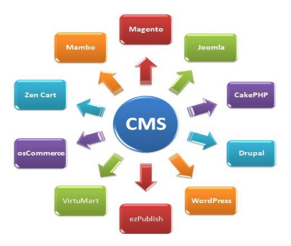
Fig.1: Content Management System

In the planned system, as discuss inside the abstract we tend to tend to stand live planning to develop the new site on-line searching System for laptop product. inside the online website, I followed the package development methodology referred to as progressive approach nicotinamide urine dinucleotide per it the system is mainly divided into 2|the 2} styles of users and two forms of mechanisms to create further appropriate for the tip users to satisfy their all necessities from one place with quick and in further comprehendible manner. Here 2 forms of user's area unit Admin and user suggests that shopper.