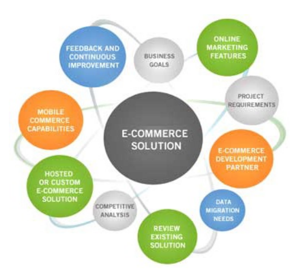
Fig.2: Online shopping Carts