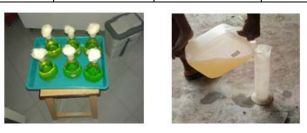
Figure 1: Correlation of durability