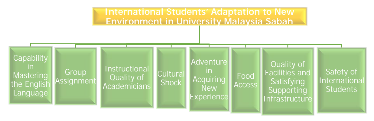
Figure 7: International Students' Adaptation to New Environment in Universiti Malaysia Sabah

Based on the interviews with 20 respondents who were involved willingly in this study, eight perspectives of adaptation to a new environment were ascertained. These cover the elements of: capability to master the English language, group assignment, instructional quality of the academicians, cultural shock, adventure to acquire new knowledge, food access, quality of the facilities and satisfactory infrastructure support, and safety of international students.