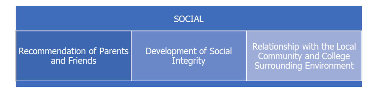
Figure 6: The Influencing of First Year International Students Experience Based on Social Theme