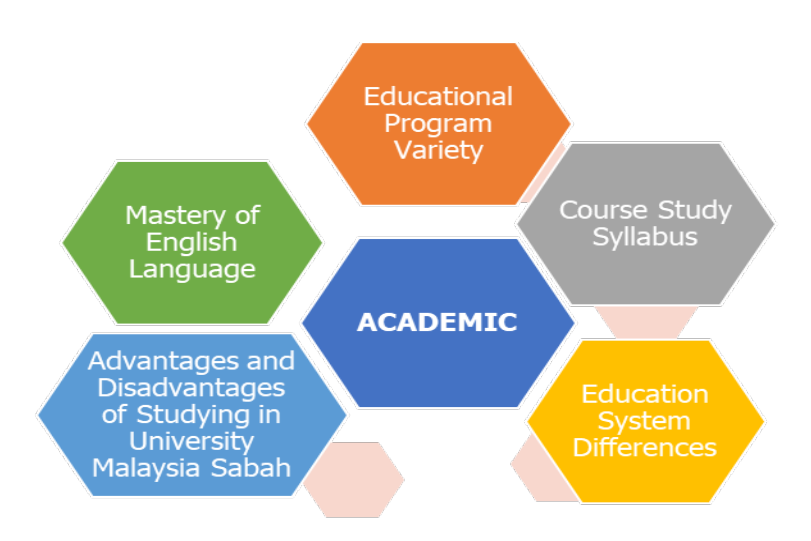
Figure 2: The Influencing of First Year International Students Experience Based on Academic Theme