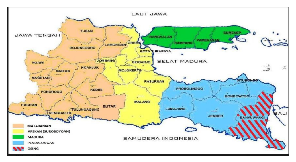
Figure 1: Local Communiy Group Map

Other groups of potential voters who would be better approached by direct meeting included those residing in Pandhalungan, which covered the area of Pasuruan, Probolinggo, Situbondo, Bondowoso, Lumajang, and Jember. Geographically, they were located in the eastern end of the Island of Java, but culturally and ethnically, they belonged to the Madura ethnicity. This meant that, in terms of religion, they were Moslems and were very obedient to the preachings of their ulammas. The following map shows the division of the province by local community groups.