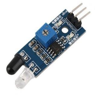
Fig 1. IR detector