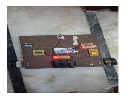
Fig 6: Result