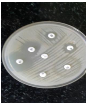
Pic 3: Representative picture showing D zone of inducible clindamycin resistance

40% of the isolates were sensitive to both Erythromycin and Clindamycin. 20% of the isolates were iMLSB phenotype with D test positive while 15% were D test negative. 25% were MLSB phenotype.