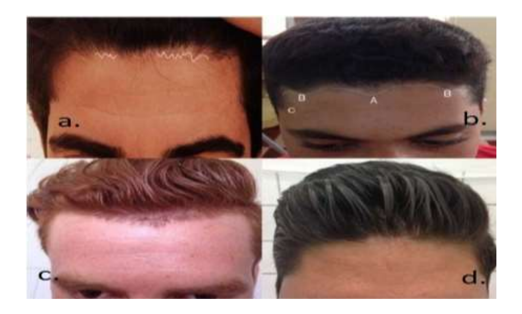
Figure 1. a. The white line shows the micro- irregularities, present in 100% of the cases; b. Macro-irregularities. A. Central Mound (widows peak), B. Lateral mound, C. Temporal point, present in 85%; c. Straight hair line. Absent widow's peak and lateral mound, presented in 10%; d. Absent widow's peak with prominent lateral mound, presented in 5%.

The mean age of the participants was 21 years old. The hair line shapes, the prevalence of macro irregularities, the hair types, and colors, and the family history of baldness are presented in figures 2, and 3, respectively.