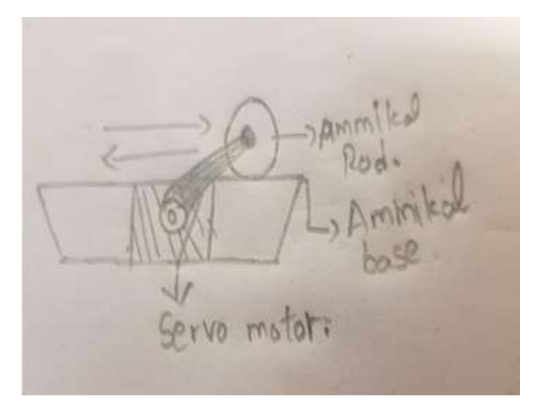
Figure 1 connection between the servo motor & ammikal

The arduino is the chip placed under the ammikal for our convenience the Arduino the figure is shown below. Fig 2 shows the placement of Arduino.