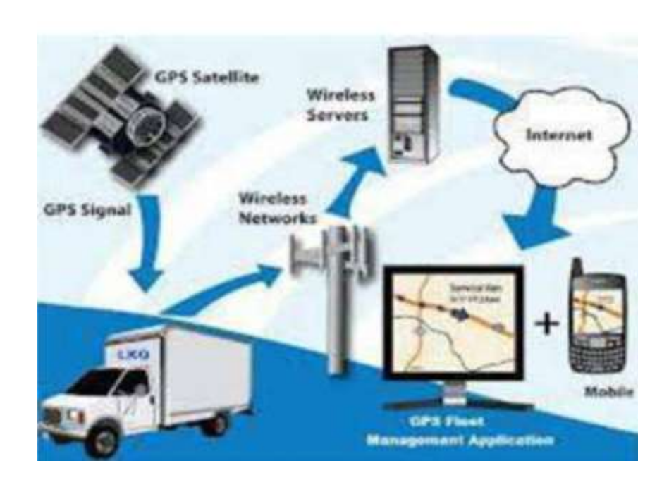
Figure 2: Block diagram of the ambulance tracking system

Microcontroller communicates with LCD it also send to through GSM module. The main application for the GPS involves mapping, tracking surveillance. The GPS module calculates the position of any user, by recognizing the signals that are transmitted by the satellites mode. Hardware of Arduino system is shown in figure. 3.