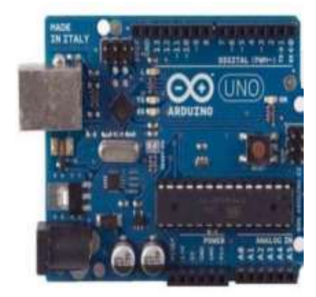
Figure 3: Hardware of Arduino system