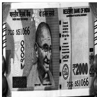
Figure 5: Colour separation

Contrast Enhancement is a method or approach to the processing of images using the histogram of the image. Equalization of Histogram does this by improving the expansion to clear the most intensity values. The AHE is a computer image processing or visioning system used to enhance contrast in images or signals. The system measures multiple histograms and uses them to disseminate image non-dark meaning, as distinguishes it from other histogram parallels. The approach changes the importance of pressure.