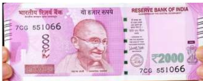
Figure 2: Input image

A digitally encoded representation of a visual feature such as a physical scene or the internal structure of a subject is a digital imaging or the processing of digital images.