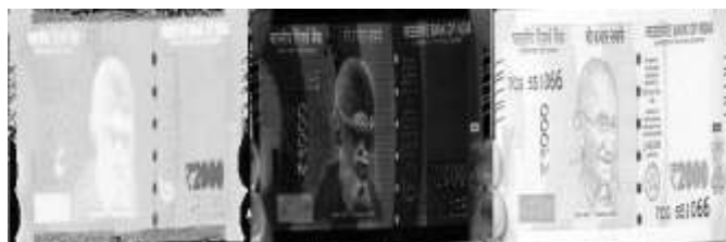
Figure 5: Segementation

Image segmentation is the separation of an image into various regions, each with unique analytical properties. In order to segment each image intensity each, five key approaches are usually needed, namely threshold method, border detection segmentation, regional processing, pixel intensity and morphology methods