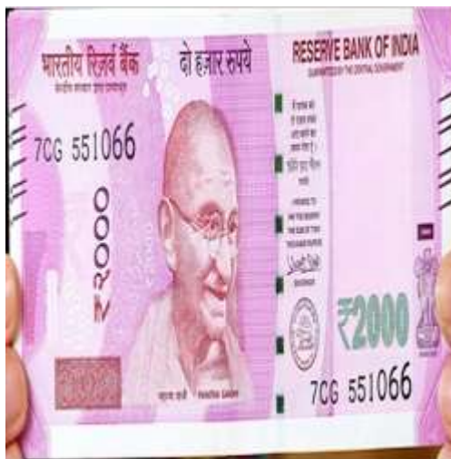
Figure 3: Resizing image

It returns image C that is scale1 times the size of D . The input image D can be a grayscale, Red Green Blue, or binary image. If D has more than 2 dimensions, imresize function only resizes the first two dimensions. If scale1 is in the range [0, 1], C is smaller than D