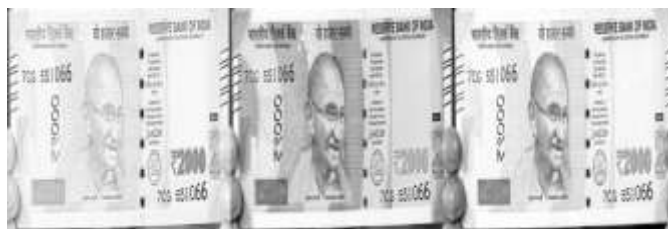
Figure 4: Colour Separation