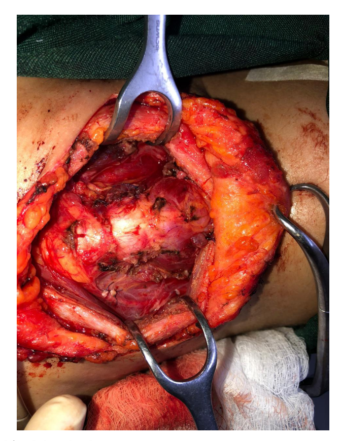
Figure 1. An exposed multinodular gland