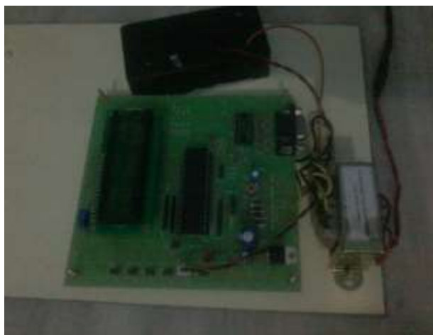
Fig.4 Image of receiver part

The receiver consists of an optical element to collect and concentrate the radiation onto the receiver photo detector; photodiode convert visible light into an electrical signal biased the photodiode operates in the photoconductive mode generating a current proportional to the collected light. The photo detector transmits these values into the microcontroller. From the microcontroller the values are sent to the 16*2 Liquid Crystal Display. In the 16*2 LCD the methane gas and heart beat pulse rate values are shown in the receiver section. This displayed value is used to ensure the safety of the workers.