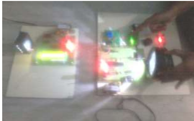
Fig .5 Implementation of the whole project

This Image shows the output of the kit. It displays the value of CH 4 sensor and Heart beat sensor in LCD when the light from the LED reaches the photo detector in the receiver part. Thus the displayed values will help to ensure the condition of workers in the scavenging environment.