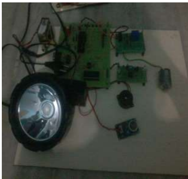
Fig.3 Image of transmitter part