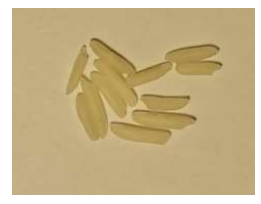
Fig (i)Rice sample

Use different rice samples as example and check the quality of the rice using cnn algorithm which is proposed in this paper, for example consider the following rice sample the output of the rice sample for quality checking is as follows: