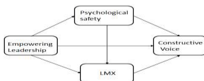
Figure 1: Proposed Research Model

To understand the robust mechanism as proposed in Figure 1 , our study proposes sequential mediation (i.e. mediation role of psychological safety and LMX between empowering leadership and constructive voice) by integrating all the above discussed variables in to one model. Firstly, the existing literature on EL, employee voice, and employee PS has been reviewed, and hypotheses have been developed with respect to the proposed relationships. Secondly, the process of data collection and methodology used for the study has been discussed. Third section consists of the results followed by the discussion in the fourth section. Theoretical and practical implications have been presented in the fifth section. The final section of the article provides an overview of the study's limitations and areas for future research.