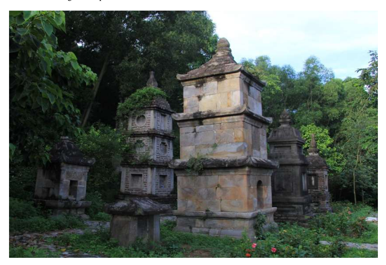
Figure 5: Tower garden in the Phat Tich pagoda

Until the eighteenth century, the authors of Tam Thuong Ngau Luc book also saw in the Phat Tich pagoda had many towers in the pagoda garden that existed until today (Figure 5). Today, there is still a 16-meter-high statue on the floor (Figure 6) and 10 animals arranged in horizontal rows, on the second-floor edge, just as the epitaph recorded, which the basis for the existence of the magnificent palaces.