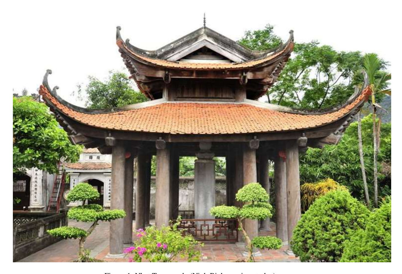
Figure 1: Nhat Tru pagoda (Ninh Binh province today)

The pagoda type has built on a pillar, growing in height in the style of tower architecture (Hinh, ND., 1992). Before the Ly Dynasty, in the Hoa Lu (the capital of the Dinh Dynasty) there was the Nhat Tru pagoda, in the garden in front of the pagoda that has a big stone pillar (Figure 1) (Monuments Conservation Institute, 2017). The local legend recounts that the stone pillar as a pillar to support the pagoda above. When the capital moved to Thang Long, the Ly Dynasty built a new capital, one pagoda-like Nhat Tru pagoda has been built at Thang Long (the capital of the Ly Dynasty).