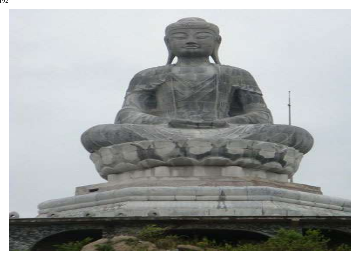
Figure 6: Buddha statue at Phat Tich pagoda