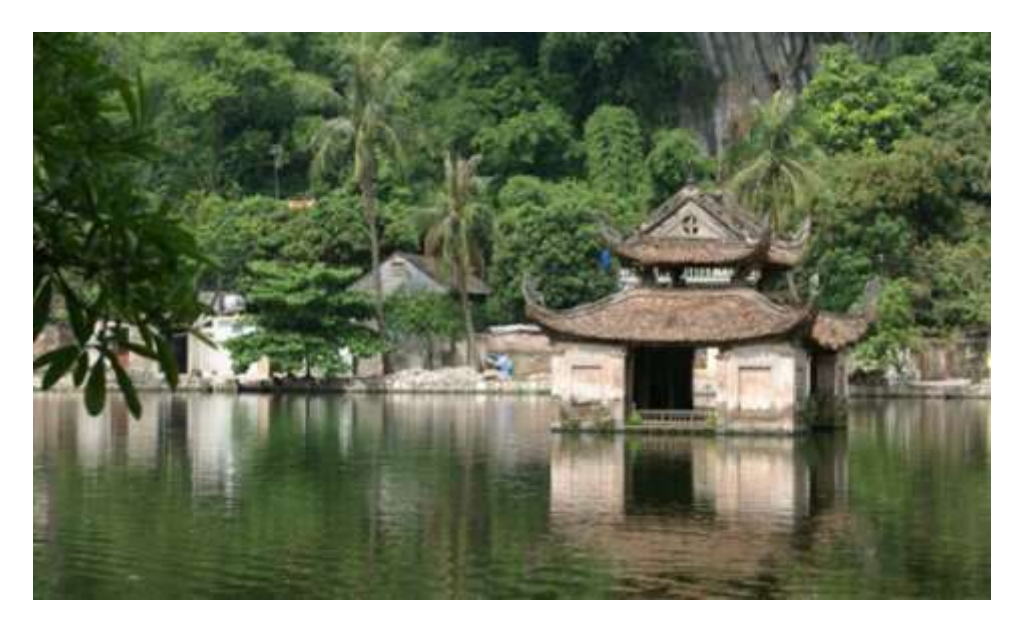
Figure 9: Thay pagoda (Hanoi toaday)

Thay Pagoda is located in Ha Tay province (Hanoi today) (Figure 9) associated with Sai Son rock mountain with many caves, including Thanh Hoa cave, where Tu Dao Hanh monks practiced, but when he comes down the mountain, the monk set up Thay pagoda to continue cultivation. Near the Thay pagoda, there is Hoang Xa cave which behind the cave door is also a place to a monk to cultivate. At the foot of the mountain in front of the cave, there is still a pedestal of Buddha statue to mark, the construction in 1099, the 8th Year of the reign of King Ly Nhan Tong (Don, LQ., 1995). It was a small pedestal, similar to the Buddha platform of Thay pagoda.