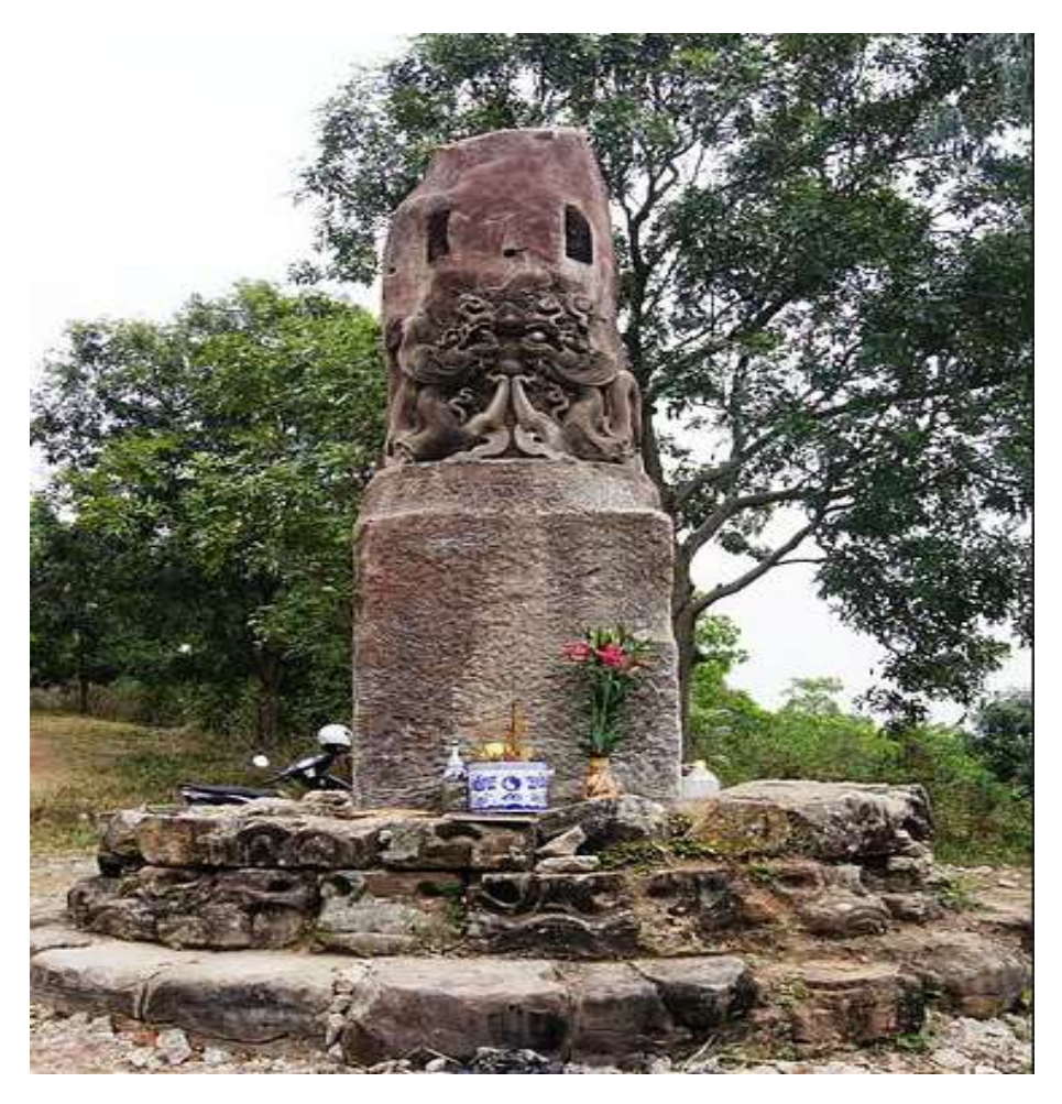
Figure 7: Stone columns at Dam pagoda

The kind of pagoda that was both in the field and next to the mountain, couldn't find traces of the tower, the scale is smaller than the pagoda with the tower. The pagoda was smaller than a pagoda with a tower but it was still quite large and noticed by the Kings Ly. The pagoda was built next to the mountain, only one layer of foundation such as Vinh Phuc pagoda was built in 1100 and Tinh Lu pagoda was built in 1119 and belongs to Ha Bac province (Bac Ninh province today), sometimes the pagodas were built in the middle of the fields such as Ba Tam pagoda (also known as Sung Phuc Tu or Linh Nhan Tu Phuc Tu) (Figure 8), was built in 1115 in Hanoi today, and Huong Lang pagoda (abbreviated to Lang pagoda, whose name is Vien Giac or Thach Quang Tu) has been built around the same time as Ba Tam pagoda in Hai Duong province today.