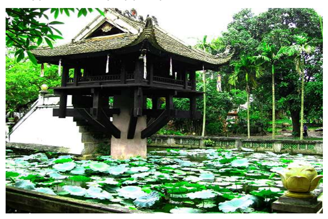
Figure 2: One Pillar pagoda - Dien Huu pagoda (Hanoi today)

In process existed, Dien Huu pagoda was repaired many times, each repair time it was added more new architectural details. However, overall, the architecture and old appearance remain unchanged (Monuments Conservation Institute, 2017). In 1100, Dien Huu pagoda was first repaired, the scale of the renovation was "better than the old one" (Thuan, NK., 2004). Old history records, "on the first time repair, extend Lien Hoa Dai lake, replacing Lien Hoa Dai name,