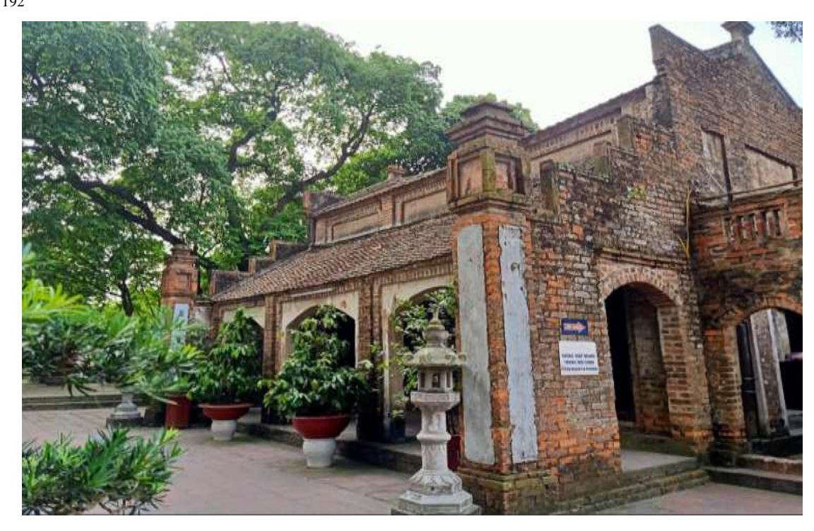
Figure 8: Ba Tam pagoda

If the Vinh Phuc pagoda and Tinh Lu pagoda have had only one floor in the mountainside with the debris of stone bricks, Ba Tam pagoda and Huong Lang pagoda will also see the scale and location of some architectures. The Ba Tam pagoda has had a doorstep to the pagoda, about 12m wide, marked by a pond digging, a railing into steps, from there to the middle of the upper part of the palace where a pair of lions are in the lotus building is 60m. The pair of lions, the lotus lake and the railing of the gate of Ba tam pagoda were seen at Huong Lang pagoda. However, in terms of the overall architecture, Ba Tam pagoda is much more beautiful.