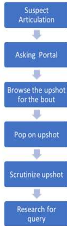
Fig. 1: Process of Interaction with the Search Engine

Interaction with search engine [3] requires what need to be search and in what context or what is the keyword that matches to most extent. This requires a need to formulate or write a query and writing in the search engine and getting the solutions [5] of the query, check for the right solution, if found the searching is done else need refinements in the query and repeating the process again.