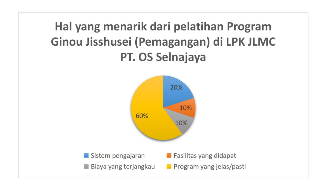
Diagram 4.4 The interesting thing from the Ginou Jisshusei (Apprenticeship) training program at the LPMC LPK PT. Selnajaya OS

Based on the diagram above as much as 60%, namely 30 apprentices choose a clear / definite program for interesting things from the Ginou Jisshusei (Apprenticeship) Program at the JLMC LPK PT. Selnajaya OS. Meanwhile, 20% ie 10 apprentices choose the teaching system, 10% ie 5 apprentices choose the facilities obtained, and the remaining 10% choose affordable costs.