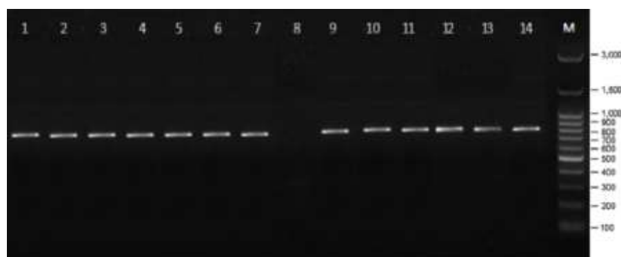
Figure 2. CVPD r DNA fragments (841 bp) of Bali citrus. Samples identity from 1-14 were: C. nobilis Denpasar, C. reticulata keprok Kintamani, C. nobilis Tabanan, C. nobilis Buleleng, C. nobilis Pecatu, C. nobilis

Gel documentation system records a single DNA band of 841 bp from almost all of the citrus samples processed with WR primer pairs (Fig. 1). Only one sample that did not produce a band, that was the C. nobilis Petang. Two citrus species used as controls were considered resistant or at least tolerant to the CVPD disease, they were T. trifolia , and the seedless C. aurantifolia . The rest of the samples, viz. 11 of them, were previously identified to be susceptible to CVPD (Yuniti, 2017).