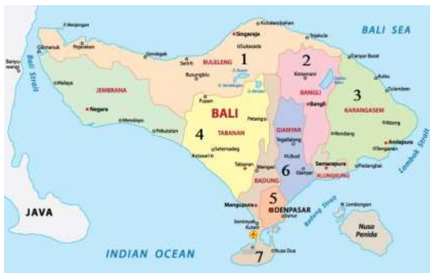
Figure 1. The sampling sites of the citrus leaves used in the study: 1) Buleleng (Singaraja), 2) Bangli, 3) Karangasem, 4) Tabanan, 5) Denpasar, 6) Gianyar Regency, and 7) Badung.

The sampling sites were the regencies and city in Bali as shown in Fig. 1. Topographically, the sites were located at the altitude of 800 meters above sea level, with the tropical climate, the average annual rainfall between 2000 and 2500 mm, and the temperature of 24°C to 32°C. The samples were taken from citrus cultivated in Buleleng, Karangasem, Bangli, Badung, Tabanan, and Gianyar Regencies, as well as Denpasar City. Leaves were collected from CVPD resistant citrus ( T. trifolia and C. aurantifolia seedless) and susceptible citrus viz. Citrus nobilis , Citrus reticulata slayer, C. reticulata keprok, and Citrus grandis . The leaves are selected from the second leaf below the growing point, wrapped in plastic and taken to the lab for further DNA isolation by using liquid nitrogen. Samples were taken from leaf bones using the NucleoSpin® kit.