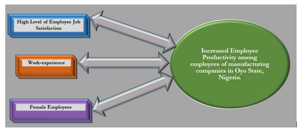
Figure 2: Model showing the factors that have a higher effect on employee productivity among employees of manufacturing companies in Oyo State, Nigeria.

Table 3 above shows that female participants reported higher (mean=62.20) on employee productivity than their male counterparts (mean=60.04) at t(223) = -2.248; P <.05 in selected manufacturing companies in Oyo State, Nigeria. This shows that differences in gender have a significant influence on employee productivity among employees in selected manufacturing companies in Oyo State, Nigeria. Hence, the results above have achieved the last objective of the current investigation, which is to examine if there are any gender differences in employee productivity among the selected manufacturing companies in Oyo State, Nigeria.