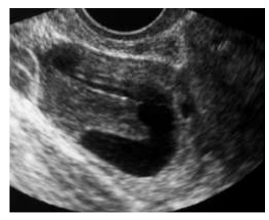
Figure 2. Transvaginal ultrasonography (US) shows a rectangular hypoechoic lesion in the cystic mass.

Over time, the clot may retract and liquefy, resulting in an undulating and concave surface. In a later stage, resolved clots with fibrin strands result in a pattern that referred to with a variety of terms, including "cobweb," "honeycomb," "reticular," "lacy," "fishnet," and "sponge" (Figure 3).