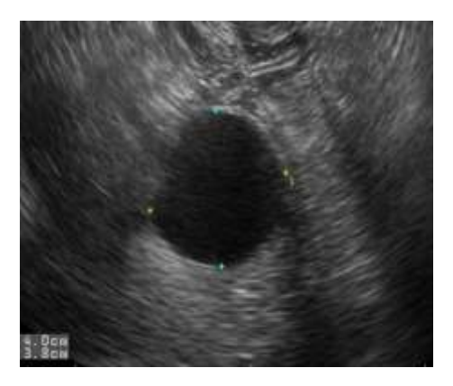
Figure 1. Transvaginal ultrasonography shows a well defined anechoic mass without a solid component.

cyst containing any kind of nonviable components.