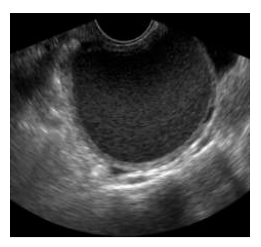
Figure 4. Transvaginal ultrasonography reveals homogeneously diffuse low echoes in the cystic mass, which is known as "ground-glass" appearance.

Mature cystic teratoma often referred to as dermoid or dermoid cyst, typically shows focal high echogenic nodules, heterogeneous internal echoes in the cyst with acoustic shadows, and multiple hyperechoic fine lines and dots, which are due to reflection by clumps of hair, sebum, or fat component within the mass. The hyperechoic area is not usually as intensely echogenic as calcification and may be confused with the echo of adjacent bowel gas.