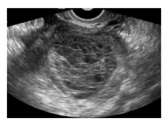
Figure 3. Transvaginal ultrasonography shows a round complex echoic ovarian mass.

Over time, the clot may retract and liquefy, resulting in an undulating and concave surface. In a later stage, resolved clots with fibrin strands result in a pattern that referred to with a variety of terms, including "cobweb," "honeycomb," "reticular," "lacy," "fishnet," and "sponge" (Figure 3).