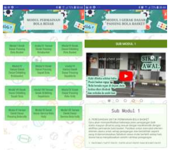
Figure 4. Learning Module Display

To facilitate the PE learning process, this application has several features of Pojok Siswa (Student Corner). Pojok Siswa can be used by students to support their PE learning process in each education unit. The learning activities displayed in this feature are adjusted to the curriculum issued and authorized by the Ministry of Education and Culture, and it is hoped that they are all in line with the curriculum applied in Indonesia, especially for PE learning at every level of education. In addition, there is a choice of class or grade in each education unit. Learning modules appears when the user chooses the type of learning activity. The materials included are, for example, large ball games, small ball games, aquatic activities, rhythmic/gymnastic activities, martial arts, and athletic activities. However, the application is still in its first development stage, thus the contents are limited to large ball games and the learning materials are such as specific movement learning for basketball games, volleyball games, and soccer games. Moreover, the contents are only for grade VII junior high school level.