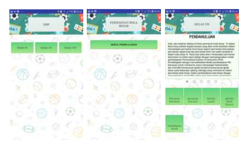
Figure 3. Pojok Siswa Display

To facilitate the PE learning process, this application has several features of Pojok Siswa (Student Corner). Pojok Siswa can be used by students to support their PE learning process in each education unit. The learning activities displayed in this feature are adjusted to the curriculum issued and authorized by the Ministry of Education and Culture, and it is hoped that they are all in line with the curriculum applied in Indonesia, especially for PE learning at every level of education. In addition, there is a choice of class or grade in each education unit. Learning modules appears when the user chooses the type of learning activity. The materials included are, for example, large ball games, small ball games, aquatic activities, rhythmic/gymnastic activities, martial arts, and athletic activities. However, the application is still in its first development stage, thus the contents are limited to large ball games and the learning materials are such as specific movement learning for basketball games, volleyball games, and soccer games. Moreover, the contents are only for grade VII junior high school level.