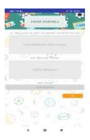
Figure 5. Learning Achievement Report Display

In the application, there is a display called Laporan Siswa (Student Report) which is intended to report student learning outcomes. After the students completed the learning process, they are required to report the results of the learning process on the Student Report page. In this report, the students are also required to write down difficulties during the learning process and they can upload their own videos or photos during the learning process. The videos or photos and learning difficulties are then sent to their PE teacher and the teacher gives feedback to the students.