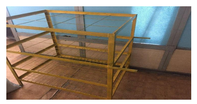
Fig. 1. General view of the bench for determining the fractional composition of solid waste

International Journal of Psychosocial Rehabilitation, Vol.24, Issue 09, 2020 ISSN: 1475-7192