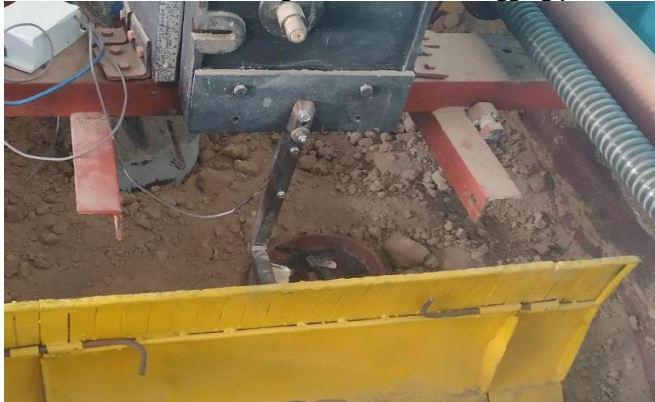
Fig. 4. The process of digging the components of solid waste at the bench of physical modeling with the openers operating position.

Figure 3: The process of digging soil at a physical modeling bench with closed openers. Here we consider the most general case of the digging process, i.e., combining digging with a set of drawing prisms.