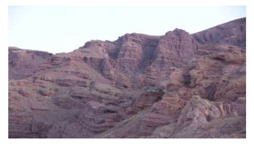
A sample of rocks and valleys of Eynali