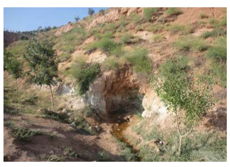
Tarlan spring of Eynali