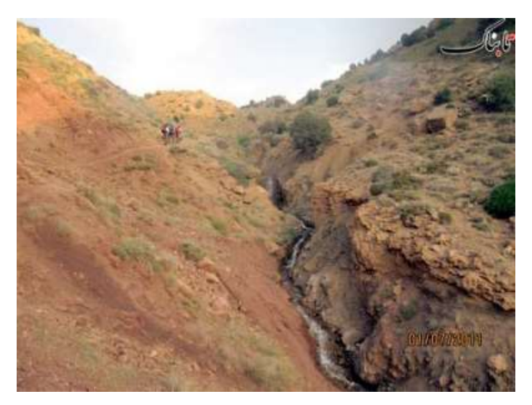
Ilan Uchan Valley of Eynali