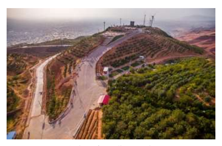
A view of Eynali Mountain