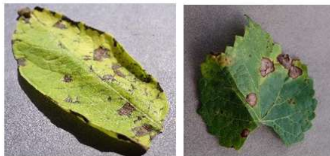
Fig. 2.6: Early Blight; Fig. 2.7: Black ROT