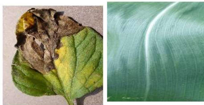
Fig. 2.4: Late Blight; Fig. 2.5: Healthy