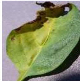
Fig. 2.8: Bacterial Spot