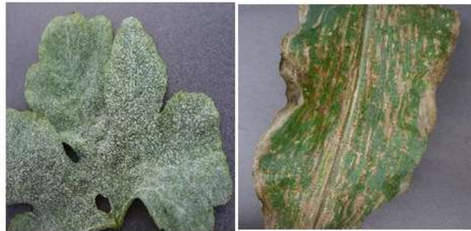
Fig. 2.2: Powdery mildew; Fig. 2.3: Leaf spot