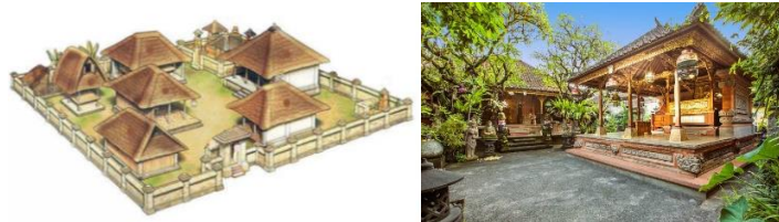
Figure 1. Traditional Balinese House Architecture

The home for Balinese Hindus is in addition to functioning as a general home (Despress 1991), but has a function of carrying out Hindu religious ritual activities (Bagus 1980, Dwijendra 2010, Nutrisia 2008, Dharmayanty 2019, Nurjani 2019). As part of community members, the house is also a pawongan part of a village with its traditional structure (Rapoport 19769, Parimin 1996, Pitana 1994, Peters 2014, Pambudi 2020) (Figure 1).