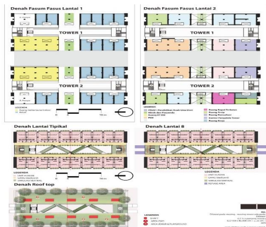
Figure 2. Typical Design of Vertical Housing in Indonesia