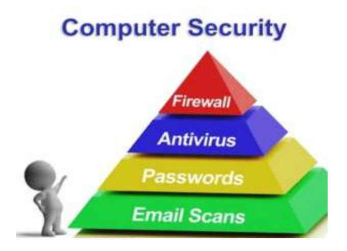
Fig 1: steps in computer security

Sites encounter 22 assaults for every day by and large that is more than 8,000 assaults for every year, as indicated by Site Lock information[1-2]. Most weakness is misused through computerized methods, for example, helplessness - scanners and hoods.