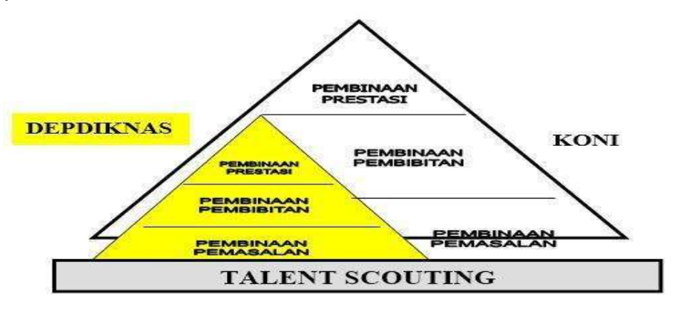
Figure 1: Pyramid of the Athlete Breeding Stage

According to Ghazali (2015), the coaching stage is divided into three levels, while the three levels can be described in a coaching pyramid, as shown below: