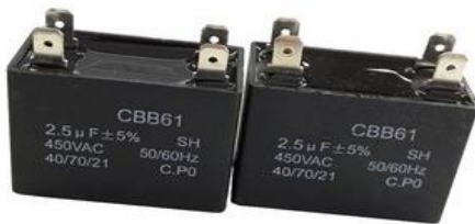
Figure 3.2: Capacitors

magnitude of the power factor on an electrical network. When the value of the power factor is above 0.9, the microcontroller does not do the calculation, and if the power factor is below 0.9, the power factor must be corrected so that the microcontroller calculates the value of the capacitor that must be installed on the power network to combine the capacitors in the electricity network using a relay controlled by a microcontroller.