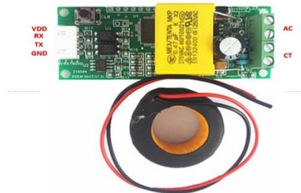
Figure 3.1: PZEM-004t

Multi measuring instrument PZEM-004T see picture Figure 3.21PZEM-004T, has 4 pins to connect to the microcontroller, and 4 connections to CT and to the load from the PLN, the connection to the microcontroller is the first 4 pins for power namely 2 pins to VCC and ground and 2 more pins to pins 10 and 11, for 4 more pins to load to measure voltage and energy and 2 more pins connected to CT to measure electric current.