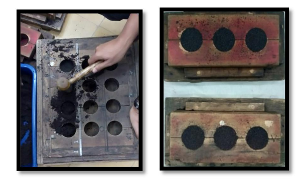
Fig. 3. Sand Compaction

3. After 1 hour, the specimen is removed from the mold and starts calculating the curing time as needed.