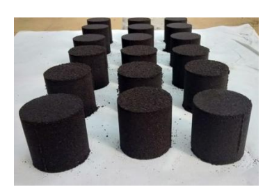
Fig. 4. Curing Time Sand Mold

3. After 1 hour, the specimen is removed from the mold and starts calculating the curing time as needed.