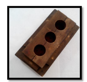
Fig. 2. Wood Mold