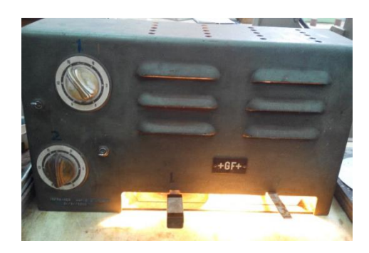
Fig. 1. Water Test Equipment

The amount of water contained in the molding sand is called the water content. Total water content is expressed in percentage (%). The water in the molding sand serves to activate the binding capacity of the clay. If the binding capacity of the clay is active, the molding sand binds to each other. The range of water content that binds to mold sand on clay is 1.5% - 8%.