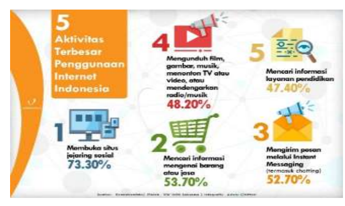
Figure 2: Online Media Usage Activity in Indonesia in 2018

Figure 1.1 above shows that teens including active users using the internet. This would require special attention to providing knowledge to young people in using social media trauma impact of cybercrime and hoaxes and literacy to young people to be able to have communication mediated social behavior to minimize anxiety in adolescents who are active in the use of online media. Based on the data obtained from https://www.validnews.id/Menyoal-Perilaku-Anak-Terimbas-Media-Sosial-Aza) States that there is five biggest activity of internet users in Indonesia which can be seen in Fig.1 below: