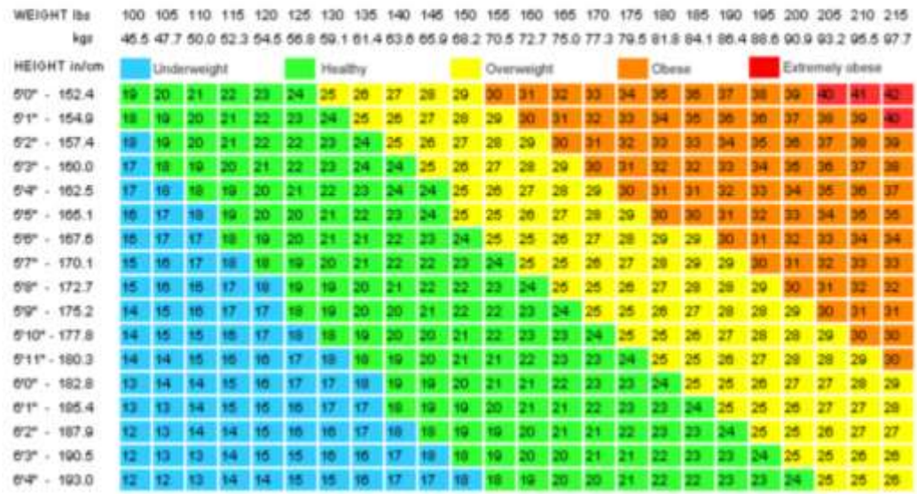
Figure 2: Basic Metabolic Index calculation

From the respondents, 3ml blood was drawn and tested for random Glucose level, total cholesterol and triglycerides level. The laboratories performing the tests produced accurate results since they routinely performed quality control tests. Including age, BMI, presence of two or more symptoms, Glucose level, Cholesterol level and triglyceride level as independent variables and risk as the dependent variable, analysis was done. Irrespective of age group if the test results showed abnormal values for