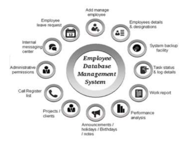
Fig 1: Management System

In addition, researchers have explored the ways in which overall performance modifications over time and the implications for overall performance measurement. Finally, there is new evidence related to the have an effect on of character characteristics on performance appraisal ratings, such as ratter desires and employee loyalty, as well as the influence of the work context of the appraisal technique [8].