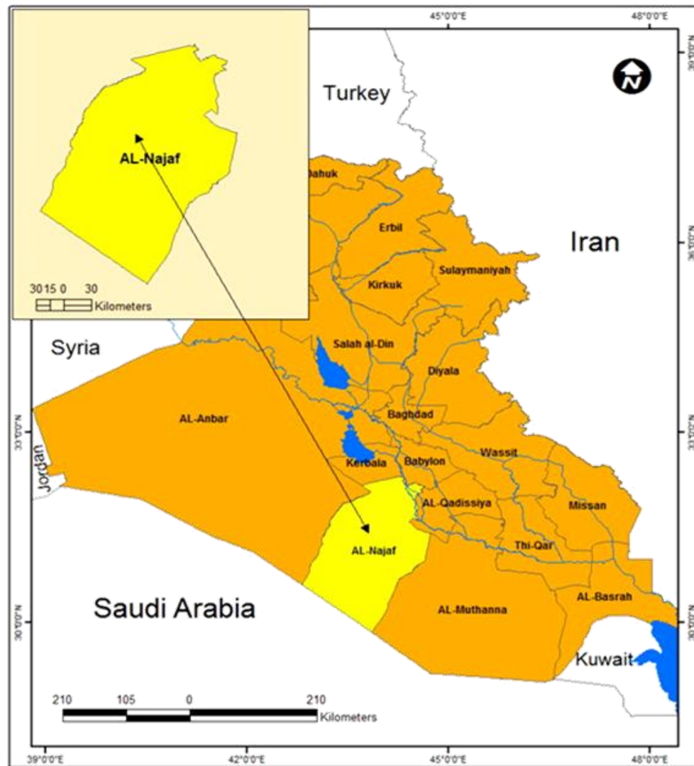
Fig 1: Site of the AL-Najaf governorate from Iraq