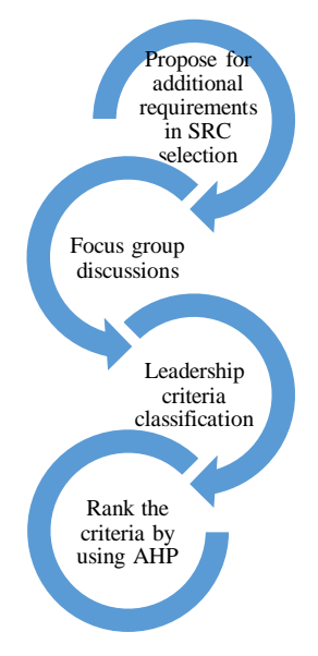
Figure 2: Flow chart of student representative council election

In the past, the leadership credential was not part of the application filtering process for any aspiring SRC candidates. Thus, the additional requirement was proposed to improve the leadership quality of SRC candidate selected. The implementation of this process is proposed to be done through the submission of students' curriculum vitae (CV) and manifesto plan together with the application form. The SRC Election Secretary committee will evaluate the documents with regards to the leadership criteria. The overall process of SRC election at UniKL is shown in Figure 2.