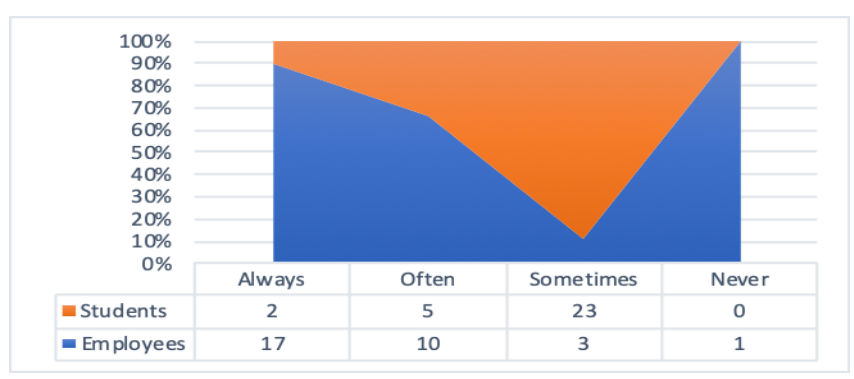
Figure 2: The frequency of using English

There are an opposite between students and employees in the frequency of using English. Most employees said they always use English especially in reading and writing because they often work with documents in English as well as they have to write English emails. Due to different positions of the employees in the company, there were still some people who sometimes or never use it. In contrast, over three quarter of students only used English when they were in the English lessons and in the English examinations except those who were in English major. In general, most respondents showed the necessity of practical English, depending on their situation. Anyway, if they have good language skills, they find it easy to access variety of materials or communicate with people [3].