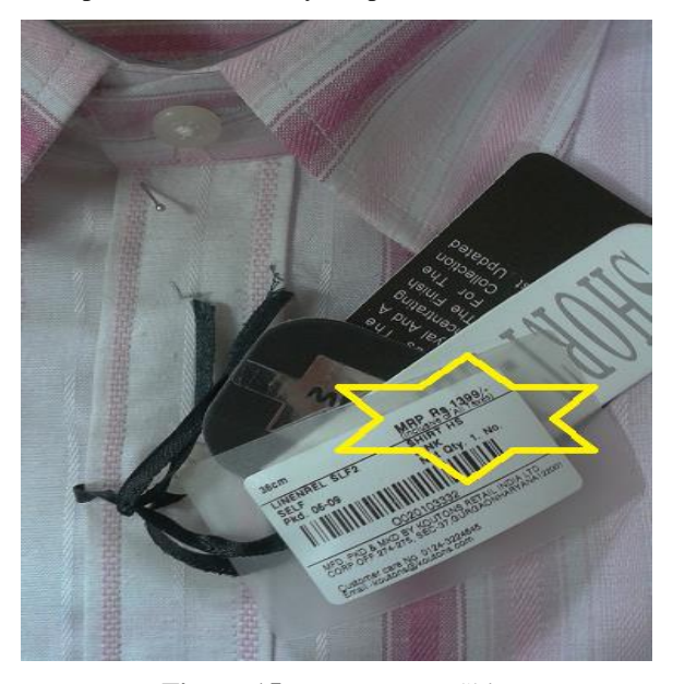
Figure 15: MRP Tag on Shirt

Some of the products are promoted in such a way that the manufacturer is providing an extra quantity of the product in the packing at the same price; when actually the price is increased according to the quantity.