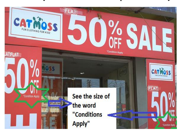
Figure 7: Catmoss Bathinda

One of the family who came for buying the clothes for their child, was of the view that the retailers are mentioning the word "SALE" in very big size and they hide away all the other details by writing "Conditions Apply" in the subscript in very small size. This practice is very irritating. This is because when one goes to the shop, selects the product and then afterwards he / she comes to know what are the details of "Conditions Apply", it sometimes becomes problematic. Because you can't leave the shop and can't buy the product either.