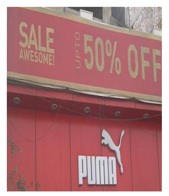
Figure 10: Puma Bathinda