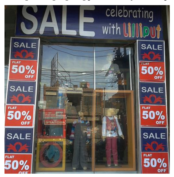
Figure 14: Lilliput Store, Bathinda