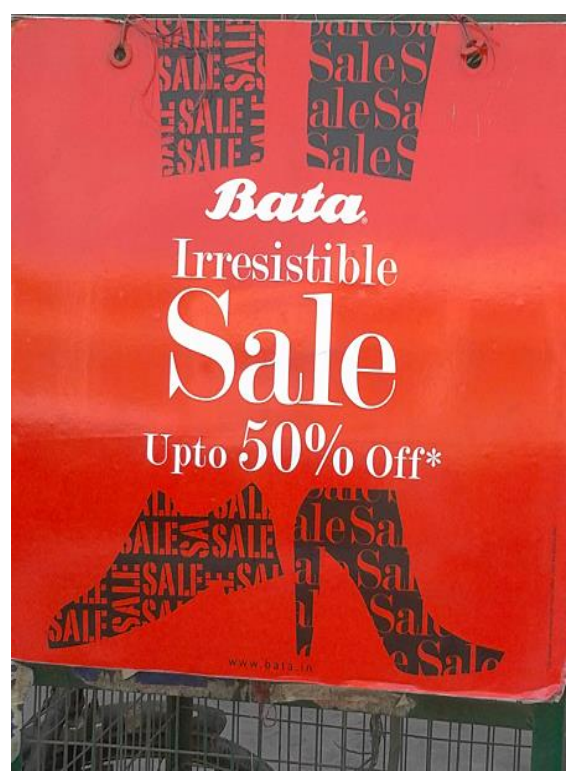
Figure 12: Bata Store, Bathinda