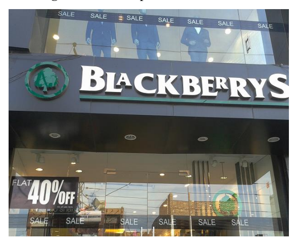
Figure 4: Blackberry Shop, The Mall, Bathinda