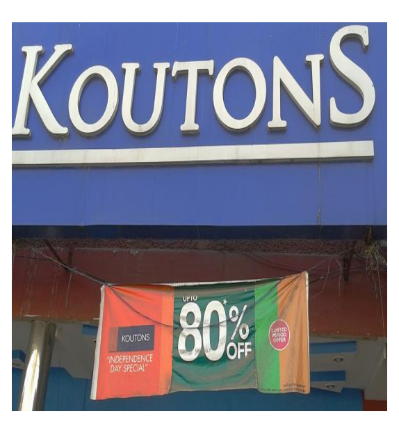
Figure 1: Koutons Shop, The Mall, Bathinda