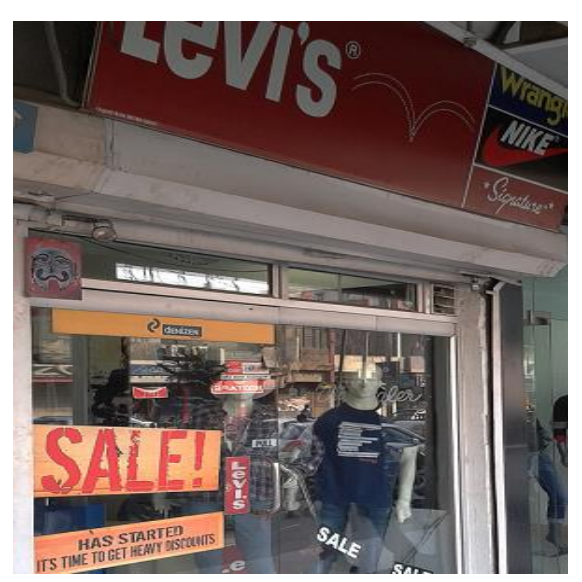
Figure 9: Levi's Bathnda

They were of the view that such generalization sometimes forces them to enter the shop; and then when they are not able to find the discount / product of their choice they have to return ashamed. Or in some cases they are forced to buy even if their pocket doesn't allow them to do so.