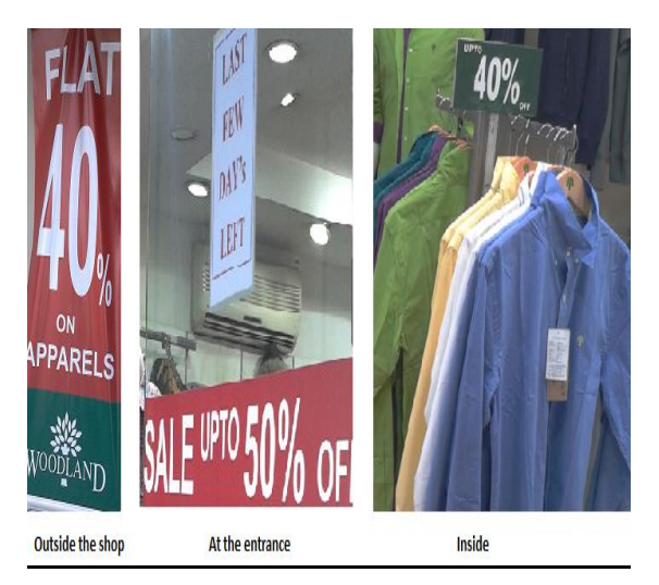
Figure 11: Woodland Store Bathinda

Some of the customers brought our attention to the fact that various retailers are using different messages inside and outside the shop. One message pulls a visitor to visit the shop. Other messages confuse him inside the shop and thus sometimes he ends up being forced to buy what he doesn't even have planned for and is not required.