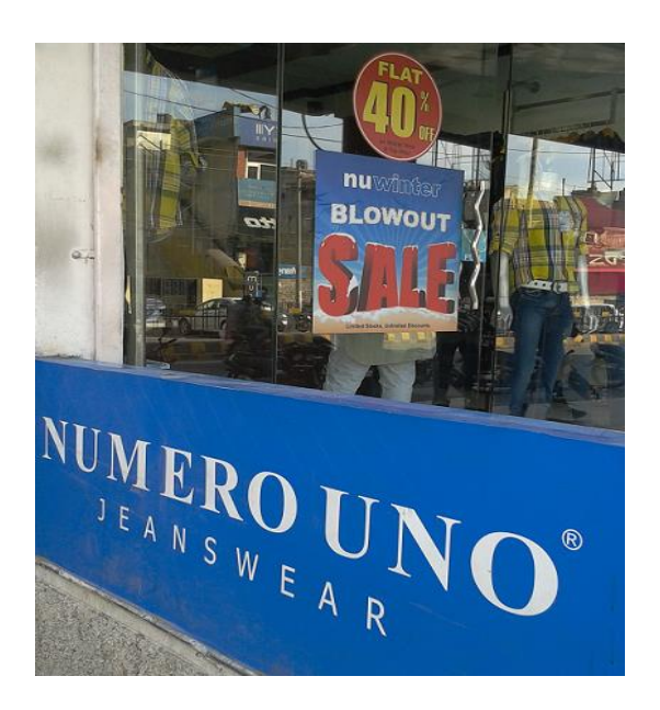
Figure 2: Numero Uno Shop, The Mall, Bathinda

Note: See the size of the word Up to and Flat respectively