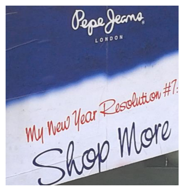
Figure 13: Pepe Store, Bathinda