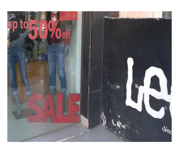
Figure 3: Lee Shop, The Mall, Bathinda

Note: See the size of the word Up to and Flat respectively