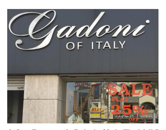
Figure 6: Sant Footwear & Gadoni of Italy, The Mall Bathinda

Note: See the size of the word Flat (Reebok)