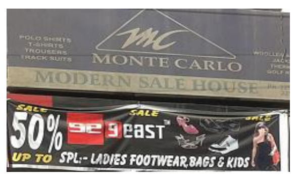
Figure 5: Reebok & Monte Carlo Shop, The Mall Bathinda

Note: See the size of the word Flat (Reebok)