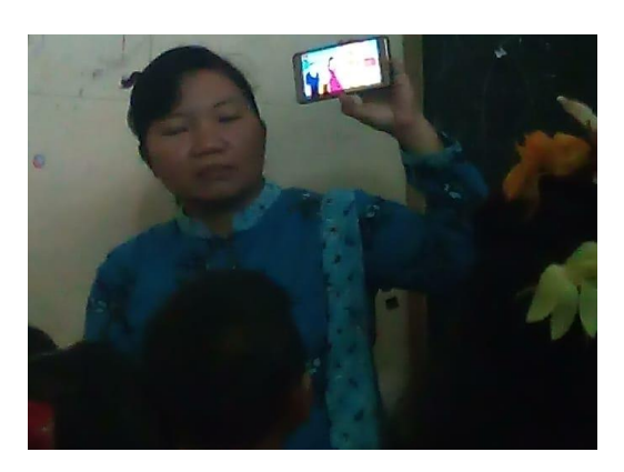
Figure 1: The teacher shows the media of images through a mobile phone

Teachers in the teaching-learning process of Hindu education seldom have to make an example but also it can be modified and explored, such as language game, musical and thinking skill (Titib, 2003). The implantation of Hindu religious values on the habitual field can be conducted continuously from greeting before starting the class, praying (silence supported) Trisandhya before starting the class, praying to begin the class. This pattern can be a good step in introducing religion to students with disabilities. In its implementation, it needs the teacher figure. In this term, the act of teachers in applying character values can be shown directly from the teacher's self, including the moral value in Hindu and emotional social development and independence.