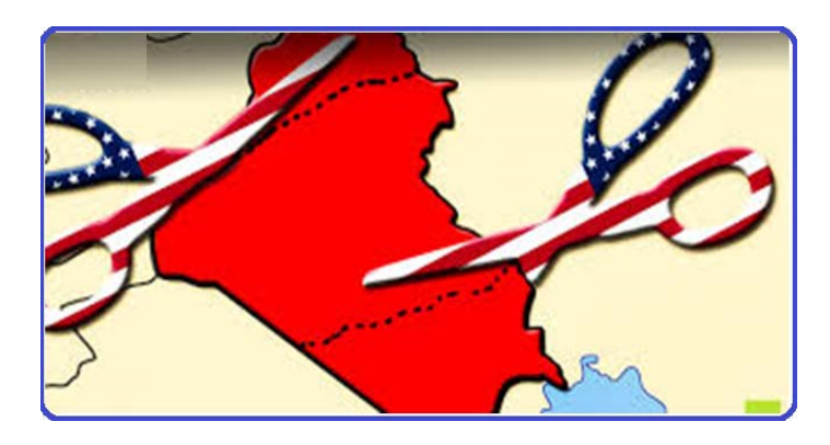
Fig. 4: Sectional division in Iraq as a result of Aggression

The U.S.-controlled attack of the realm in year2003, takes the origin reason of part is an passion in stake Aggression Arab Iraq. Stake -2003 legislations have been conquered thru the rivalry concerning sect-centric Shia with Sunni strengths<sup>(96-100)</sup>.