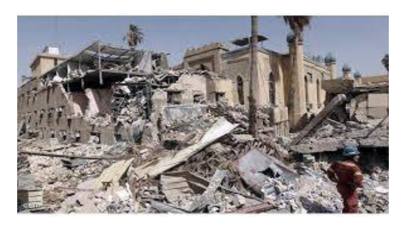
Fig. 3: Demolition of Infrastructure as a result of Aggression

We were oblivious, haughty, besides to spontaneous, with we unbridled hominid distress that did no respectable to any person: not aimed at Americans, not aimed at Iraqis, not aimed at the district. Virtually many years later, the harm to America's upright in the ecosphere since the Iraq Aggression has motionless no mended<sup>(89-95)</sup>.