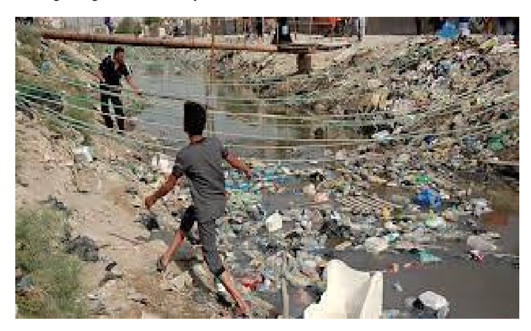
Fig. 6: Environment and Lack of Services as a result of Aggression

Accessibility of water to cultivation, commerce and domestic provisions is a main issue to Iraq. The superiority besides to measure of the realm's water is jammed thru upstream stemming, effluence, macro climate alteration with inept custom. Iraq's milieu has smarted critically from the bearing of unfortunate plans on effluence and store controlling. As a outcome, the realm is unprotected to a variety of conservational issues, counting scarcity, desertification and growing soil<sup>(126-129)</sup> salinity.