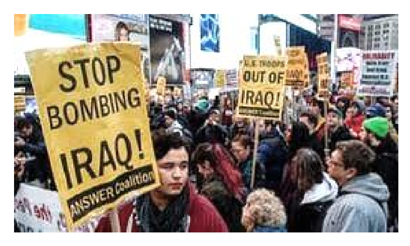
Fig. 1: Anti Aggression protest in London in Year 2002

Aggression, while these taken erected with uncontrolled former in Sadaam Hosain's statute already the 1991 Gulf Aggression. The sightings of these chemical guns did no provision the regime's attack logic (41-52).