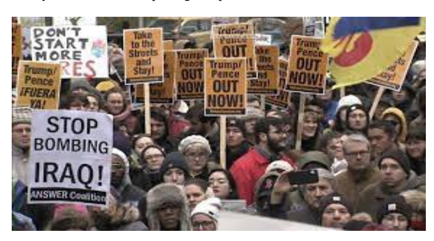
Fig. 2: Anti Aggression protest in (U.S) in Year 2002

Accomplishment the Iraq landing veracious is no evenhanded a stock of antique precision; it is a difficulty of domestic refuge currently with in the forthcoming. Corrupt quarrels roughly the Iraq Aggression sully the flea market of designs at impartial the jiffy once America desires a hearty<sup>(53-66)</sup>, well argument nearly how greatest to chance overseas-directorial value tasks, from swelling unlimited-command alteration to the failure of egalitarianism besides the ascendance of repression. Enduring malice besides to polemical quarrels finished the Vietnam Aggression sustained to dent American direction to years subsequently that struggle completed. Until the U. States attains at a extra composed -with truthful-taxation to the Iraq Aggression, it resolve be shuffled besides to alienated as it looks an progressively hazardous<sup>(67-89)</sup>, rupturing ecosphere.