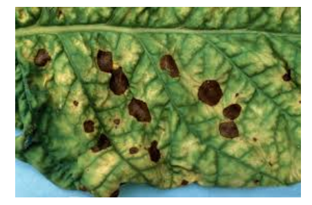
Figure2: Input diseased leaf

The following figure depicts the leaf specimen and final output of this project which helps to identify the disease.