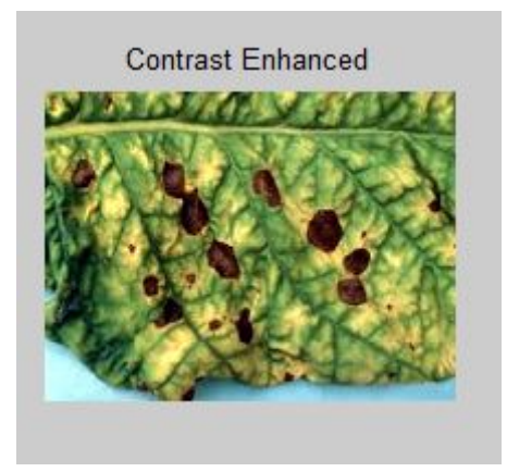
Figure 4: Enhanced Leaf