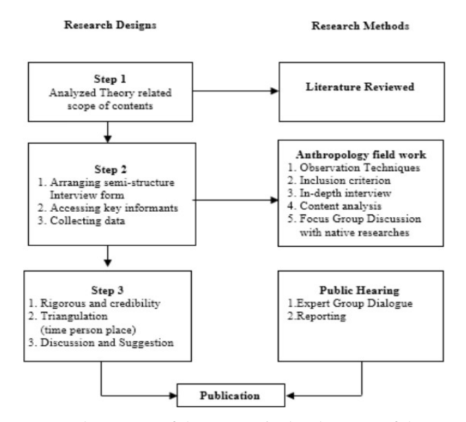
Figure1: Research process to study process of the economic development of the community, based on the social and cultural capital of the community in the lower northeastern regions.

Research process has developed into 3 steps consisted of analyze concept, created research tools, conducting anthropology field work, and to assess processmodel results. Steps were shown in Fig. 1