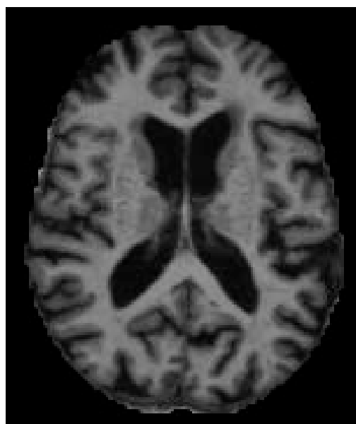
Figure 2: Normal Image

In This paper the proposed classification algorithms tested on 66 MRI pictures of which 33 tests are observed to be Normal and 33 are AD. The feature set 60x72 was given as input to classifiers. From the Table 1 indicates texture feature values of Mean and Standard Deviation for AD and HC it is observed that the following features gives better result in classification. Spatial grey Level Dependence Matrices (SGLDM) the features are Correlation, Inverse difference moment, Sum entropy, Difference entropy, Information measures of correlation, Information measures of correlation 2 , Sum average and Entropy. From Gray level difference statistics (GLDS) the features are Energy, Entropy and Contrast.