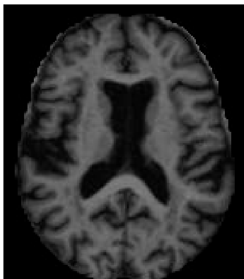
Figure 3: Alzheimer Image

From the Statistical feature matrix (SFM) the features are Periodicity and Roughness. From the Fractal dimension texture analysis, the features are Fractal dimensions Texture analysis-1 to 4. From the GLRLM, the features are Short Run Emphasis, Low Grey-Level runs emphasis and Short Run Low Grey-Level Emphasis. So totally out of 72 features 20 features were useful to get good classification results.