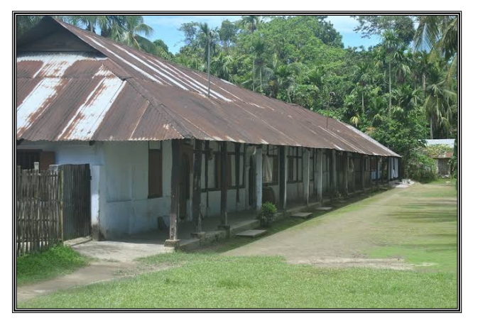
Figure 4: The Hati of Sattra

The heart of all religious activities of a Sattra is the Namghar . It's a long hall with sheet roof and an apsidal façade. It acts as a prayer foyer as well as the seat of all gatherings and deliberations. The real shrine where the representational image of the deity and the sacred scriptures are kept is called Monikuta . It is comparatively a minor structure attached to the eastern or southern part of the prayer hall. The prayer hall and the shrine are replicated on the structural pattern of a typical temple which has a Garbha-Griha contains the Picture and a Mandapa hall. The Naamghar with its apsidal facade and the Manikut attached to it closely resemble the important temple of Kamakhya with a same apsidal Mandapa hall adjoining to the important shrine. On the four sides of the Sattra premise stand four lines of huts known as Hati where Bhakats belonging to different categories dwell. In Sattras of monastic type where only celibates are allowed to live, the Hatis are completely inhabited by celibate devotees. In most of the existing Sattras , however, the system of constructing Hatis is not strictly imposed the doorway leading to the interior of a Sattra is typically noticeable by a small open abode known as Karapat , a derivative Sanskrit word . Eminent visitors are first welcome at Karapat and then, they are accompanied to the core structure of the Naamghar .