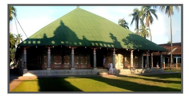
Figure 2:Naamghar of BarpetaSattra