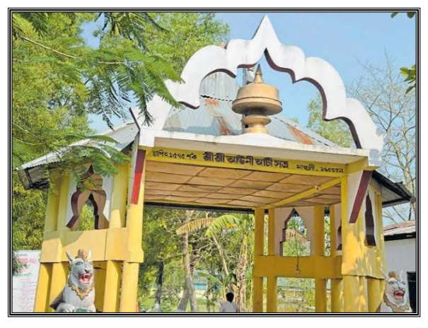
Figure 3: Karapat or Batchora of Shree ShreeAuniatiSattra