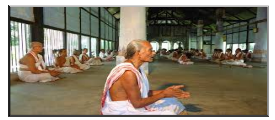
Figure 5: The Nama-Kirtana of Sattra