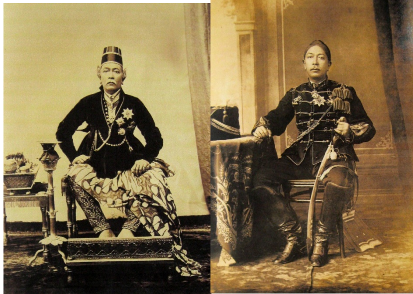
Figure 1 & 2: Sri Sultan Hamengkubuwono VII, sitting position with the official greatness of the palace. (Left), and Sri Sultan Hamengkubuwono wore the Dutch military outfit complete with the rank and weapons in the position of the seat (right).

Portrait photos of Sultan Hamengkubuwono VII and Sultan Hamengkubuwono VIII can be visually influenced by Victorian style. Victorian style is an art style that emerged from the Middle Ages to the late 19th century. The name Victorian refers to the reign of Queen Victoria (https://id.wikipedia.org). In that era, a person's photograph was shown with rigid poses and a tense or serious face to illustrate dignity, courtesy, success, luxury and accentuating the social status of a person. It was also reflected in the photograph of Sultan Hamengkubuwono VII as king in Yogyakarta describing the character of an authoritative individual, imbuing a figure worthy of respect because of his social status. While in the Indis era the photos of individuals and families are also a central theme in the creation of culture/culture documentation in order to express one's status.