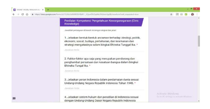
Figure 2: Civic knowledge assessment