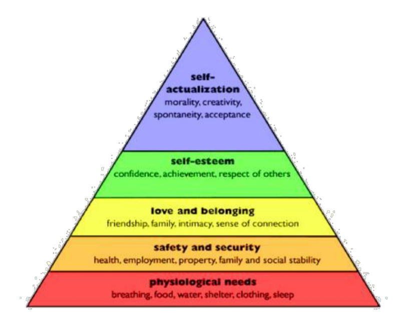
Figure 1: Maslow's Need Hierarchy (Maslow, 1965)

Maslow's theory is distinguishing to theories of motivation in tow concepts which are deprivation (an unsatisfied need) and gratification (a satisfied need).those two thoughts determine the behaviour. The deprivation (an unsatisfied need) present in negative response and gratification present in positive reaction. The five-level of needs based on Maslow's theory is divided into two levels, which are deficiency needs or D-needs and being need or B-need. The deficiency needs or D-needs include all four levels, at the deficiency, needs human will not feel satisfied unless they were deprived. in, addition, once they feel confident at the previous level, the feeling of deprivation will appear to the next level. On another hand, needing or B-need which include the last level, which is called Self-actualisation, it is the final level that the employees can reach, within feel full motivation and satisfied (Smith,2003). A cycle of motivation, support employees to be satisfied with their work, is ongoing and never reach ending beside it is varied, complex and fluctuating. Thus, theories of human motivation should be aware of it (Smith,2003; Upadhyaya; 2014; Osman et al.,2017)