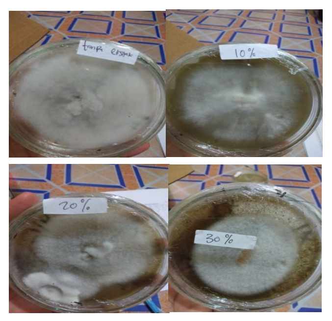
Figure 1: Fusarium fungi resistance area sp. on the 7th day

From the results of research that has been done, it can be seen that the area of fusarium f. where the treatment without betel extract (K0) can cover the entire surface of the cup this can be seen in Figure 1.