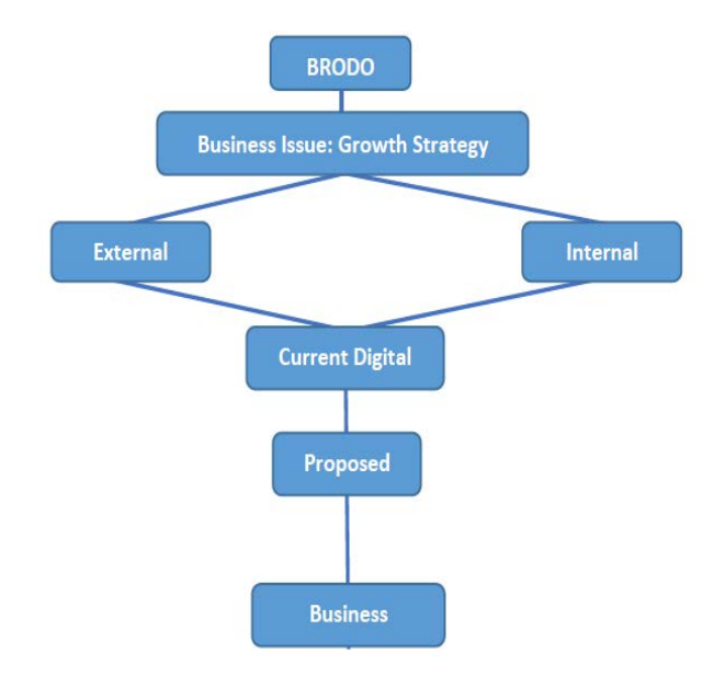
Fig. 3: Conceptual Framework

The crucial issue for a startup is growing speedy. one in every of the boom approach is in virtual promoting strategy, notably for an on-line startup company. to analyze however digital promoting aid increases methodology in brodo, this takes a glance at can conduct via many ranges. the tiers taken on these studies as follows: examine the external element three analyze 7c's of shopper interface and analyze contemporary Frodo's digital advertising and promoting strategy. it's going to describe however brodo use digital advertising as increase strategy. this examines embrace advertising mix and it'll possibly be consciousness on the virtual neighborhood. and adding dimension system to judge however an extended method body liquidates digital promoting space. once finding out those factors, this abstract framework ought to discover the inspiration of reasons and remedy the matter of startup organization have; business enterprise increase strategy. Then this examine can deliver some development for his or her virtual promoting approach to seize quicker growth.