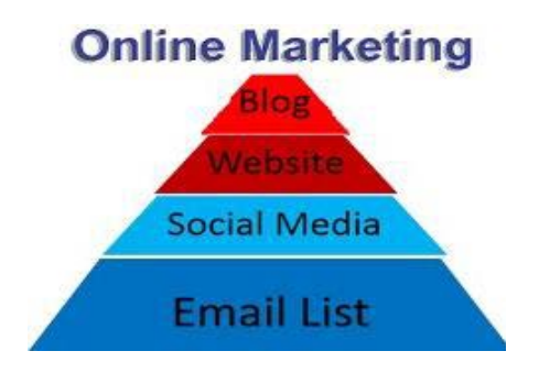
Fig. 2: Online marketing

E. Email Marketing: Whilst you ship a industrial message through email correspondence to an inventory of ability shoppers, the approach is cited as email advertising.