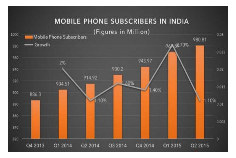
Fig 1: Mobile phones subscribes in India

Advertising and promoting land has genuinely explicit even for offline purchases, cardinal of shoppers, with pride owning a Smartphone, can communicate net medium to succeed in an alternative. this is often the strength of digital advertising and promoting those agencies and advertising consultants can be got to leverage within the destiny to remain within the reckoning.