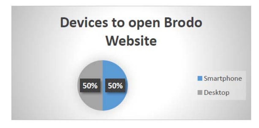
Fig. 7: Deviced used to brood website (Survey 2016)

In recent times in virtual field, having cell data processor for e-commerce square measure terribly essential.groups of people square measure a lot of of their smartphone than computer|information processing system|machine} or computer. Several articles declared that web users currently square measure their time a lot of in smartphone doing browsing or maybe searching in e-commerce computer. thus this survey additionally asked more or less however brodo's shopper access the web site and that hobby they did from their tool.