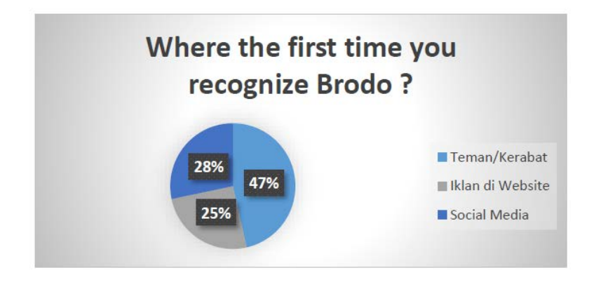
Fig. 6: Respondent first digital channel when recognize (Survey 2016)

For higher info regarding brodo's shoppers, this survey additionally asked regarding however they acknowledge brodo, from that channel, and that tool they use to urge admission to brodo's web site. The result shows that 46% respondents knew brodo from their buddies and idolized ones, 28% from social media, and 25% from advertizing in others web site. This answer can facilitate management to determine that channel have to be compelled to be optimized. And it will keep their advertising price by method of choosing the correct channel to sell.