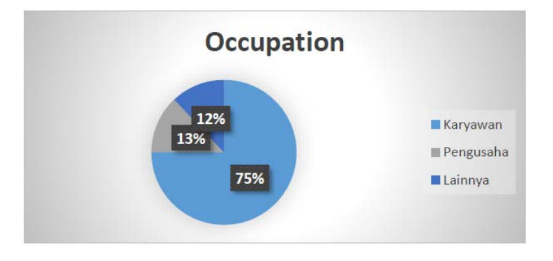
Fig. 5: Respondant Occupation (Survey 2016)